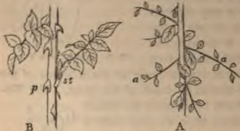
Fig. 11. SLOE AND ROSE, WITH THORNS AND PRICKLES.

No less interesting in certain of its aspects is the study of the "thorns" and "prickles" which "set the rosebud," or give to the hawthorn its characteristic name and feature. The popular botany of every-day life is content to consider prickles and thorns to represent one and the same kind of structure. But the science of likenesses is careful to ask us to make a